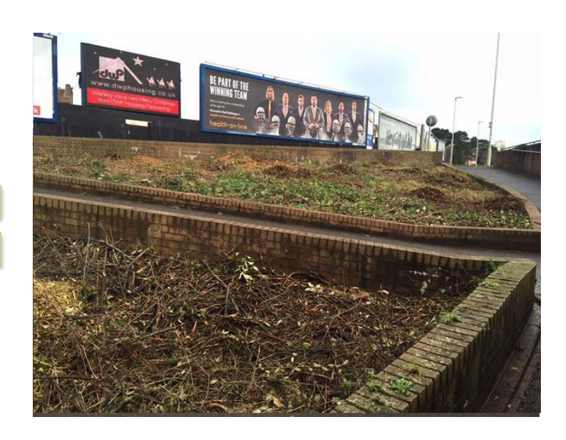
BLS and volunteers litter picking Bear Pit – 9th January 2016