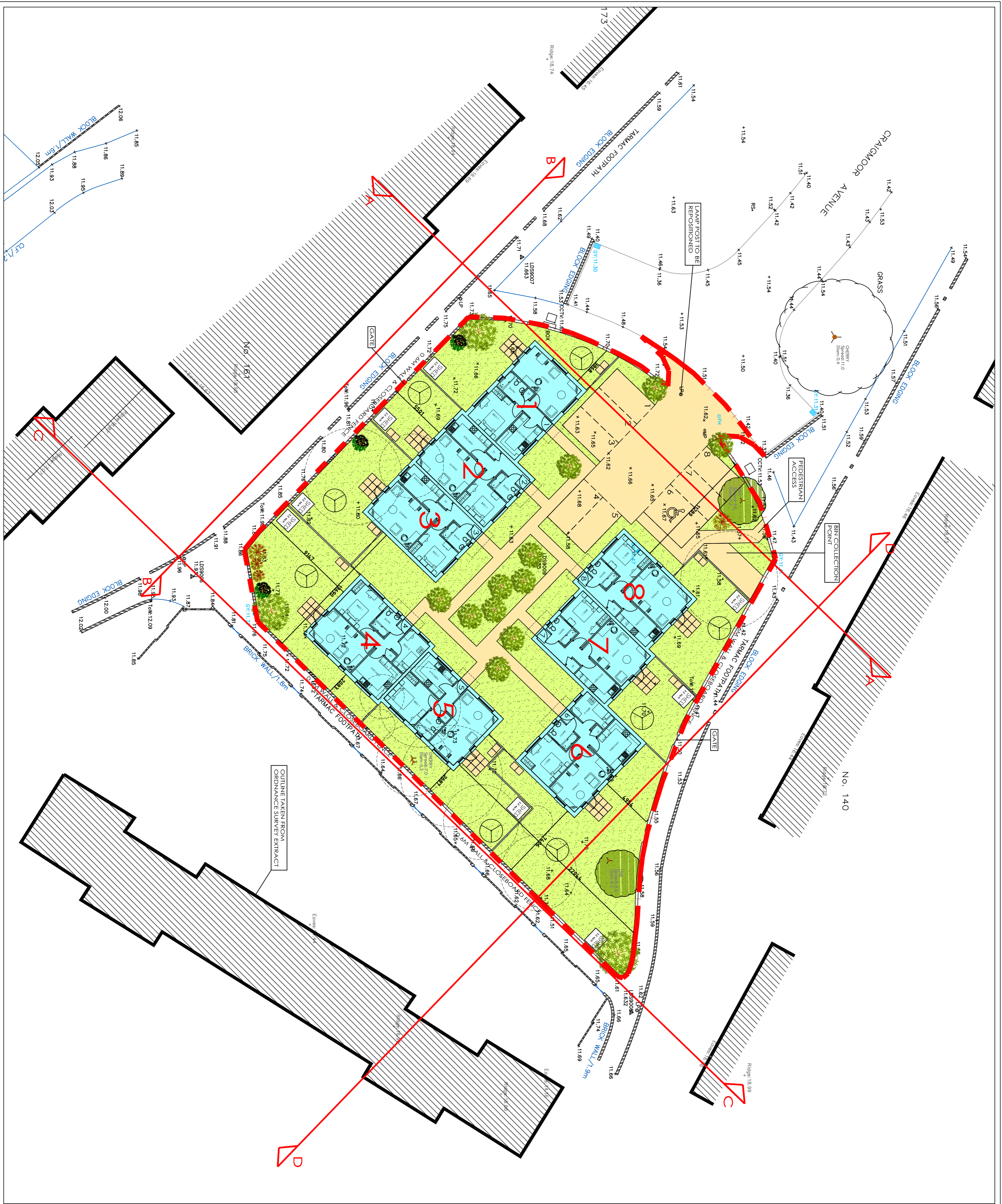
SITE PLAN SCALE 1:200 BASED ON TOPOGRAPHICAL SURVEY INFORMATION